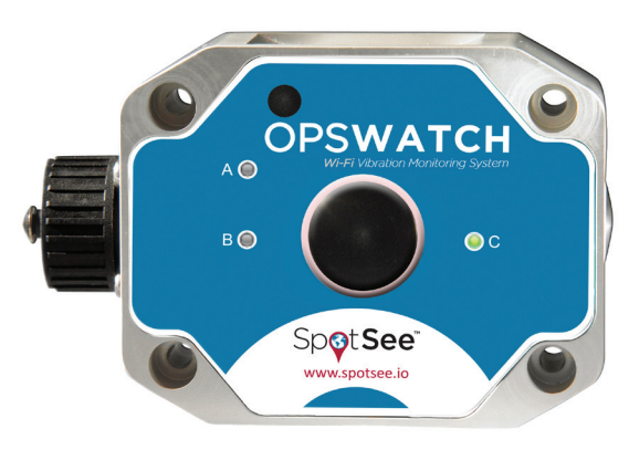
OpsWatch - WiFi

The results are increased up-time, extended service life, reduced maintenance costs of mission critical equipment and fewer catastrophic failures.