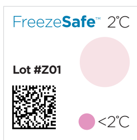
Exposure Less Than Activation Time